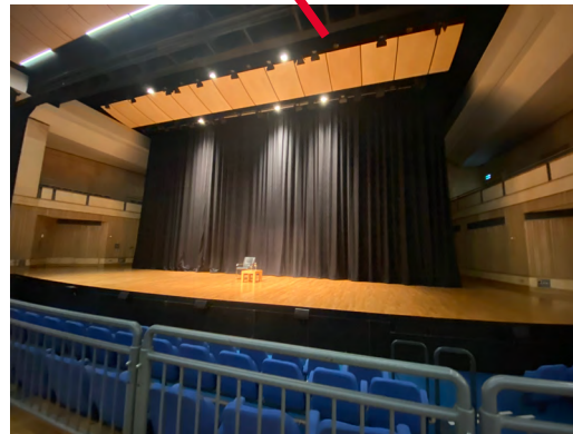
Example view from Row D