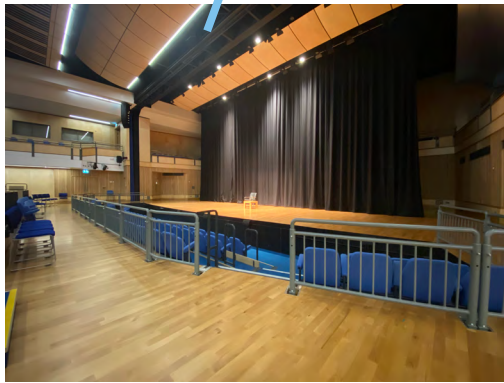
Example view from Row Z